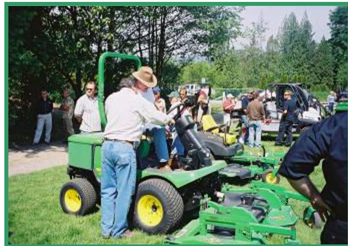
The group tries out some equipment.