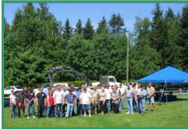
Groundskeepers and maintenance staff gather at Sunnyside Lawn Cemetery.

March 14- 16, 2007 – CCABC & FSABC annual conference, Kelowna